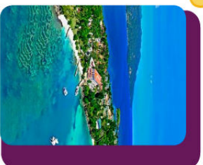
Catalina Island (Dom. Rep)